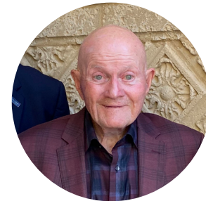
ALUMNUS OF THE YEAR