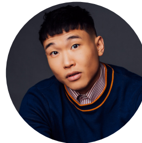
YOUNG ALUMNUS AWARD